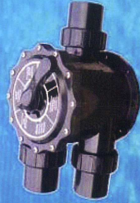
Model: HT-720 2" Top-Mount