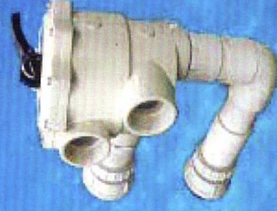
Model: HT-920 2" Side-Mount