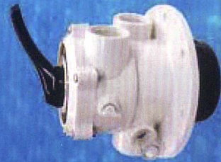
Model: HT-715 1.5" Top-Mount